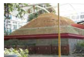
[Lei Cheng Uk Han Tomb]

Did you know that the oldest building of Hong Kong was built in the Han Dynasty? Surprising, isn't it? It is the Lei Cheng Uk Han Tomb, located in the Sham Shui Po district. Hong Kong belonged to Boluo County then. Although historians aren't sure why and who built the tomb there, Hong Kongers are grateful for this masterpiece. I wonder if the residents living beside the tomb hear things at night?