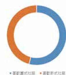
各級同學對於新舊社服的看法

很多同學都比較喜歡現在六社的社服，因為舊式的社服款式比較簡約，而且顏色鮮艷，容易分辨各社，所以大部份的同學都比較喜歡舊式的社服。不過，亦有不少同學對新社服充滿期待。