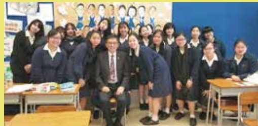
衛可培老師與中六畢業生