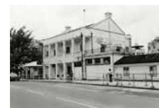
[Old Stanley Police Station]

Sham Shui Po has another old building too. It's the Sham Shui Po Police Station. It was built before World War Two, when a large influx of immigrants from mainland China settled in the area after the war. And you ask why Sham Shui Po is one of the most scattered areas in Hong Kong.