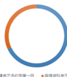
各級同學對分班的看法

德貞曾按選修科把高中學生分為一班，現在改為按成績分班。很多同學都比較喜歡現在的分班方法。她們認為如果跟差不多成績的同學一班不論對老師和同學都有好處，減少了學習的差異，亦令每個同學得到更合適的支援。